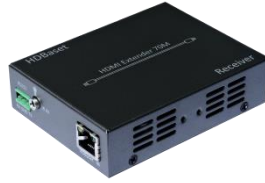
HDBaseT to HDMI Receiver RX x 1pcs