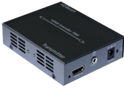
HDMI to HDBaseT Sender TX x 1pcs