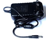
DC12V 3A Power supply X 1pcs