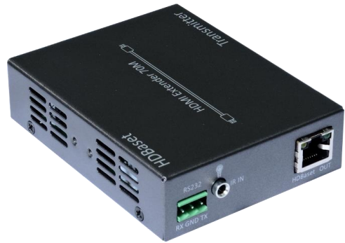
The sender B