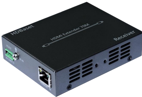
The receiver A