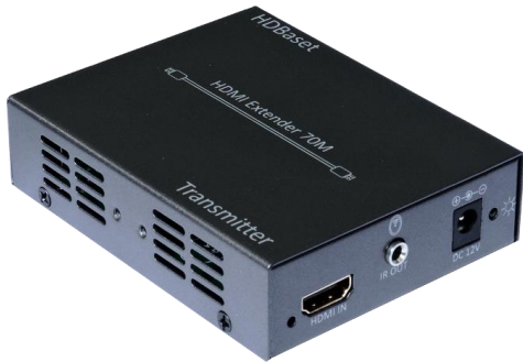
The sender A