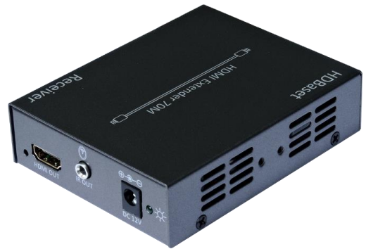
The receiver B